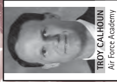
TROY CALHOUN Air Force Academy