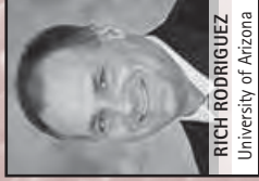
RICH RODRIGUEZ University of Arizona